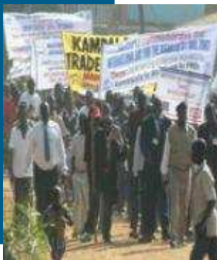
A procession during the IDD Celebrations in Nebbi.

The disability movement in Uganda joined the rest of the world to celebrate the international day of the disabled on 3 rd December 2007. This year's celebrations were held in Nebbi. The celebrations were held to highlight and to promote an understanding of disability issues .