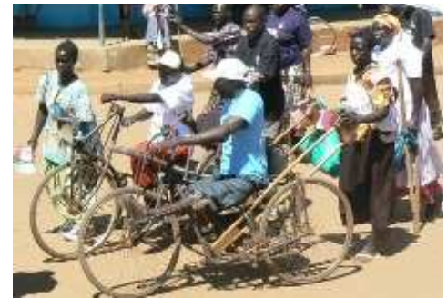
PWDs will be the main beneficiaries of this fund

The activities shall be implemented over a period of two years 2008-2010 in the districts of Soroti,Guu and Masaka.NUDIPU was among the 27 NGOs