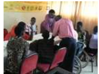
PWDs during FGD in Gulu

The campaign was birthed in Kenya during the UNAIDS Global coalition on women and HIV/AIDS 2004. The first meeting took place in Cape Town South Africa.