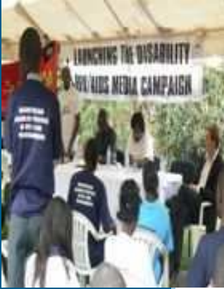
A cross section of Participants during the Media launch in Kampala

>There were over fifty (50) participants who took part in the national media campaign in Kampala. Sixteen (16) representatives from Disability people's organizations attended and Twenty six (26) reporters from different media houses attended the launch.